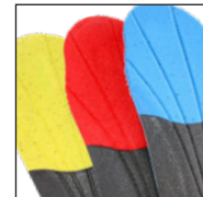
HAIX® Vario Wide Fit System