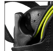
HAIX® Climate System