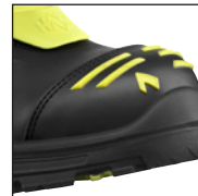
HAIX® High Durability Cap System