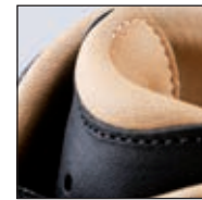
Leather liner inner