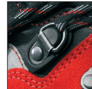
HAIX® 2-Zone Lacing